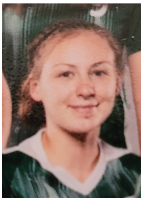
Makenzie Castle - Grayling